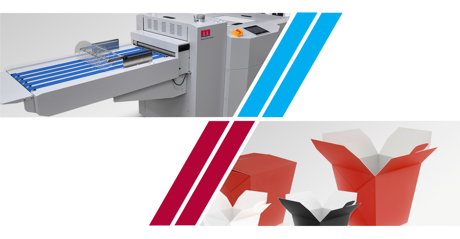
Morgana RDC Rotary Die Cutter